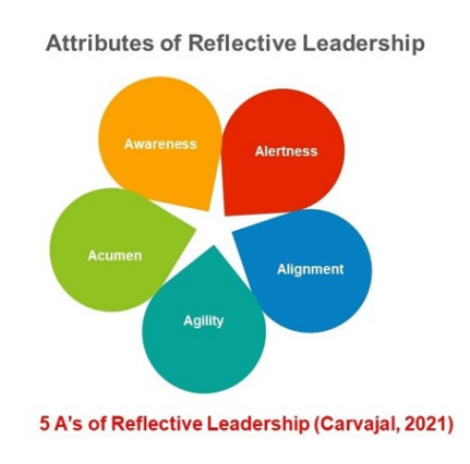
Figure 1. The 5A's Of Reflective Leadership